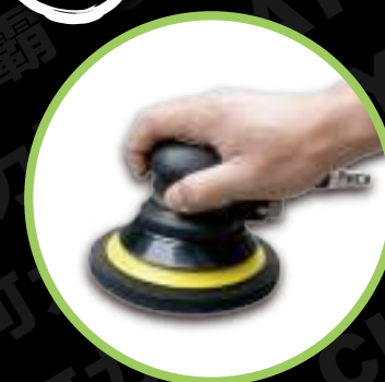
CLAY PAD for Air Polisher Velcro