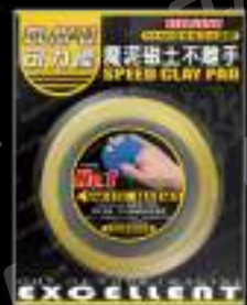
CLAY PALM TYPE