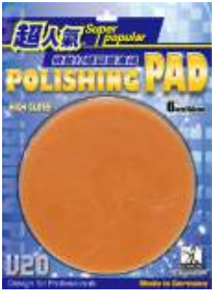
V20 Made in Germany – Polishing