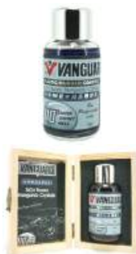
▲ Plastic parts