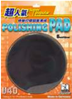
V40 Made in Germany- Buffing