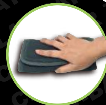
CLAY PAD TRI-FOLD CLOTH