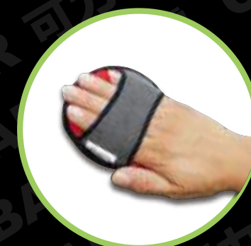
CLAY PAD PALM TYPE