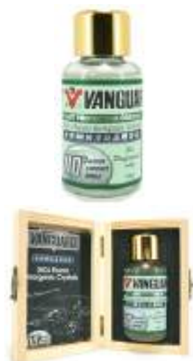
▲ Lacquered paint